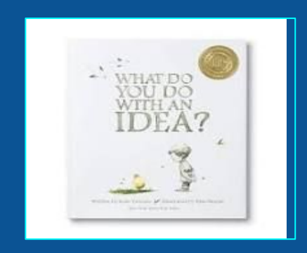
What Do You Do with an Idea? by Kobi Yamada

5th grade students in all elementary schools were surveyed to find out what their career interests were. Here are the results: